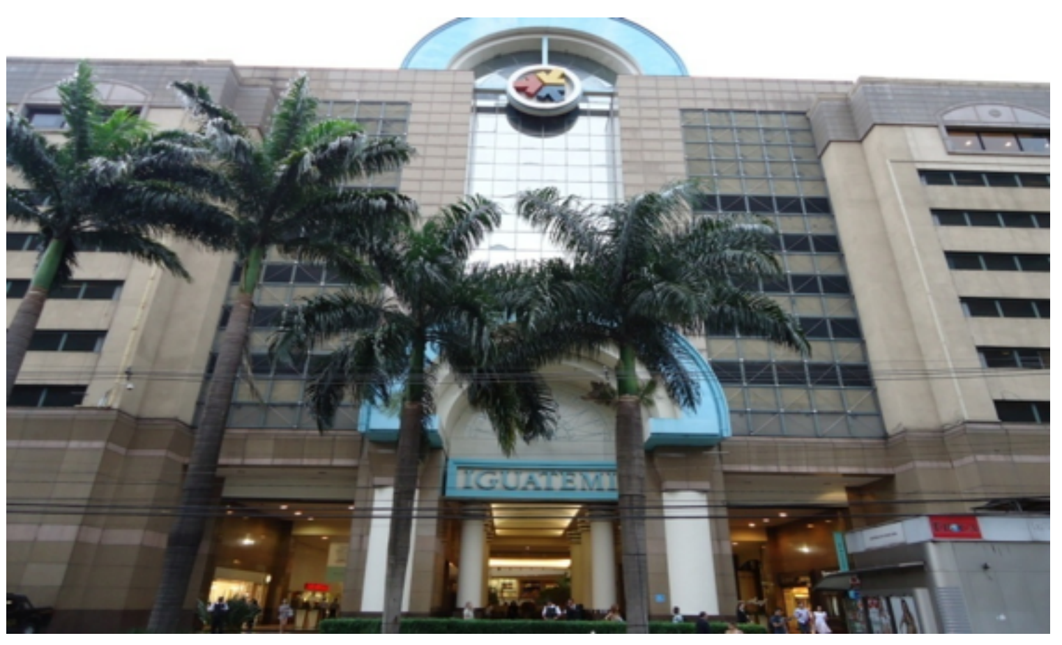
Iguatemi, the luxury shopping mall, which lies between the financial district and the Jardim Itaim Bibi.

At each stage in the project, there is a call for funds corresponding to a percentage of the final value of the property. Investors subscribing to the transaction agree to pay the costs if they remain participants in the project until completion. This speculative dimension makes sense when considering that bank loans may be taken out; the duration of construction of property lasts at least two years, as of the approval of the project (when the promoter is sure that costs will be covered) and its inauguration; and that the ownership of property is a future commodity that can be resold. For investors, the success of the operation lies in the upward trend of property prices in the interim period. Given this context, it is clear that risk is involved, hence, the importance of seeking the support of individuals, who are capable of making sound decisions and who are financially solvent. This is quite feasible during a growth cycle, especially since "they tend to have strategies of exploring opportunities to diversify sources of income by systematically engaging in speculative, profitable and short-term financial investments in real-estate." <sup>52</sup>